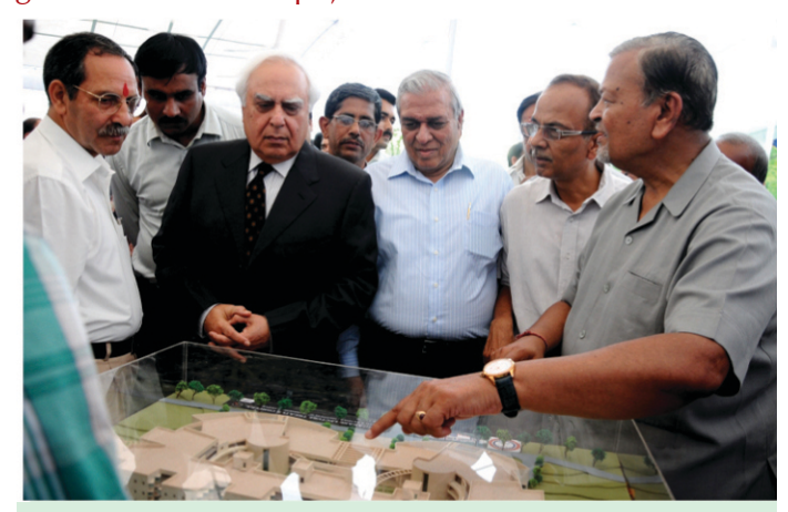
Chief Guest Hon'ble Shri Kapil Sibal watching Model of the New Lecture Complex