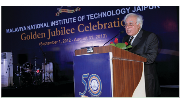
Hon'ble Shri Kapil Sibal (Minister of HRD & Communication and IT, Govt. of INDIA) Chief Guest, Delivering his address