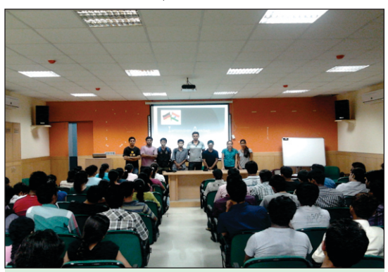
Student Interaction during orientation session

The Institute conducted an Awareness Program at the Design Centre on August 6, 2012, for increasing awareness about Summer Internship in Foreign Universities. All the students who have been to various universities in Germany, Switzerland, etc. shared their