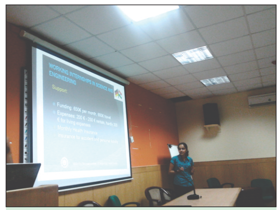
Orientation Session for Foreign Internship

experiences with the participants. Benefits and opportunities through such internships were discussed with the