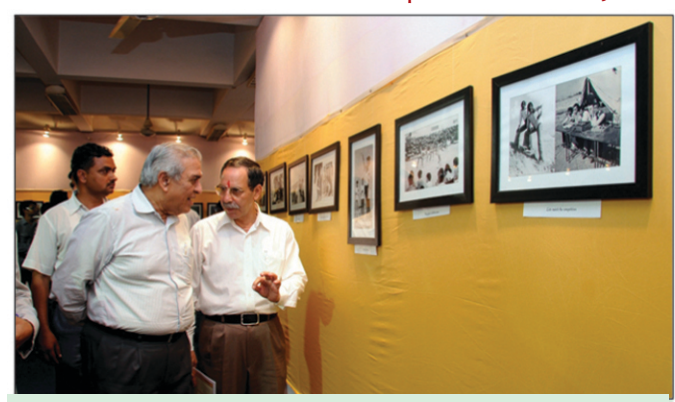
"SHADES OF MNIT" Photo Exhibition MREC to MNIT 50 Golden Years Photo Journey...