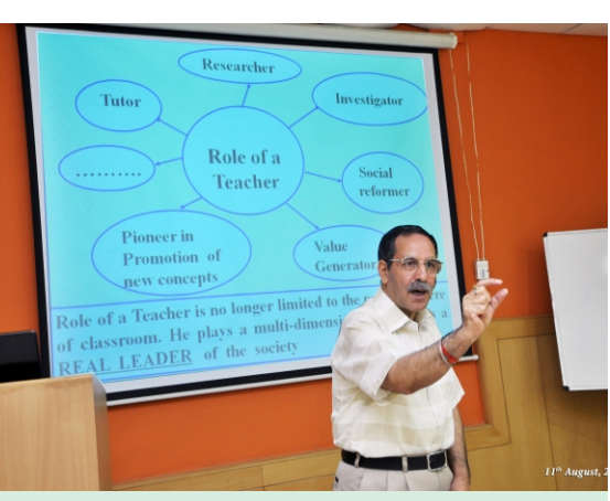
Director delivering Lecture to new faculty members at Induction Program

An Induction Program for newly recruited faculty was organized on August 11, 2012 which included an interactive session with the Director. There were five sessions in the program in which the newly recruited 27 faculty members belonging to various