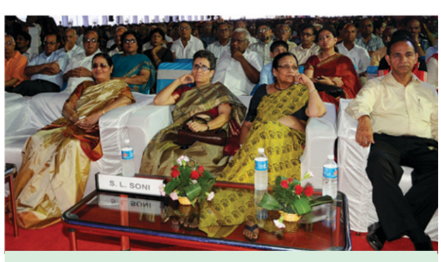
The August Gathering