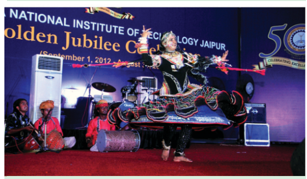
Kalbelia Dance by - GULABO