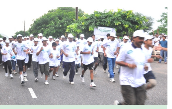
MNIT Marathon Beginning

environment. About 1500 students, faculty, staff and