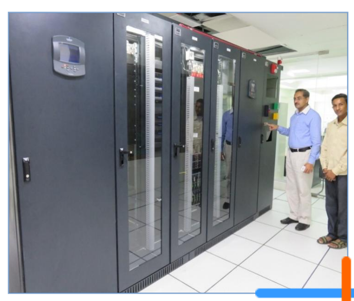
Emerson Smart Row Racks

MNIT has procured world class Emerson Smart Row solution for its Data Centre. A simple, fully integrated row-based infrastructure with precision cooling, power management, monitoring and control technologies, and fire suppression all in an enclosed system. This Solution has a room neutral design that lets you avoid many of the significant costs that come with a conventional data centre build out. Favourable implementation costs compared to using conventional data centre approach, due to savings from integrated fire suppression and ability to work in an existing normal environment without dedicated room cooling reduce energy consumption by up to 27% compared to a data centre with conventional design, perform less maintenance and reduce the costs of adding more racks to the existing solution.