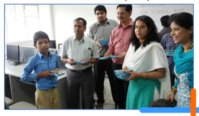
Distribution of gifts to the students

Department of Computer Science and Engineering, organized a free computer educational programme titled IT Awareness and its Application on 10 July, 2015 for the kids of government school (MNIT campus) as part of an activity under Digital India Week. Around 50 students participated in the