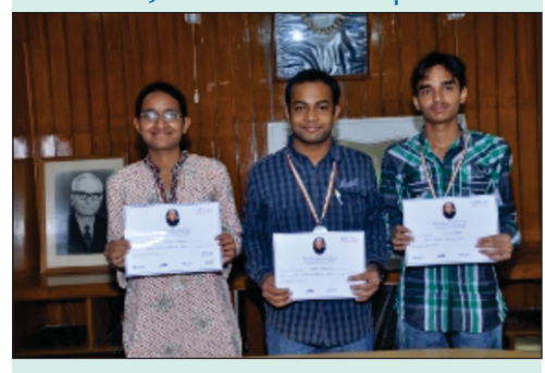
Winners of O.P. Jindal Scholarship