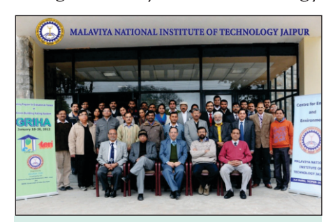
Participants of Evaluators and Trainer of Green Building Rating System: GRIHA

A three-day Training Program for Evaluators and Trainers of Green Building Rating System: GRIHA was organized by Center for Energy