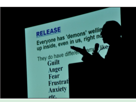
Director, MNIT Delivering a talk to students of MNIT

interactive session with the Heads of all departments and the Deans.