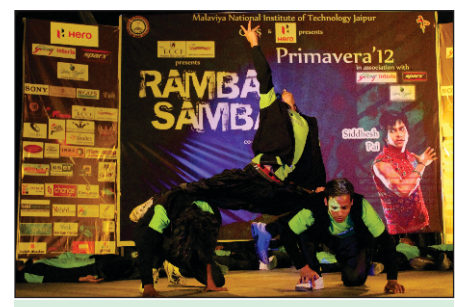
Events of PRIMAVERA