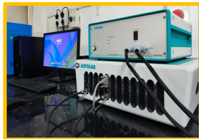
Multichannel Chemical Workstation